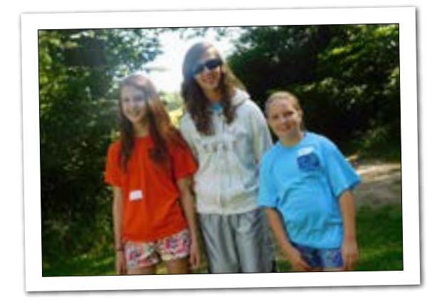
"I felt safe talking about my feelings." --10-year-old girl